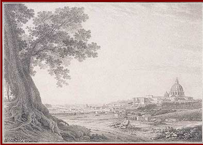
G.B. Lusieri, "Veduta di Roma da Monte Mario", The J. Paul Getty Museum, Los Angeles