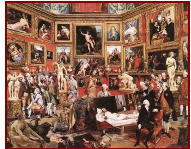
J. Zoffany, "The Tribuna of the Uffizi", Royal Collection, Windsor Castle